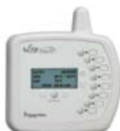
EasyTouch Wireless Controller